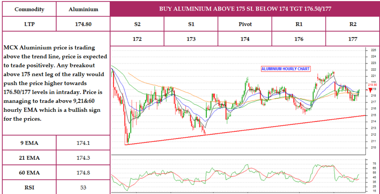
Chart of the days